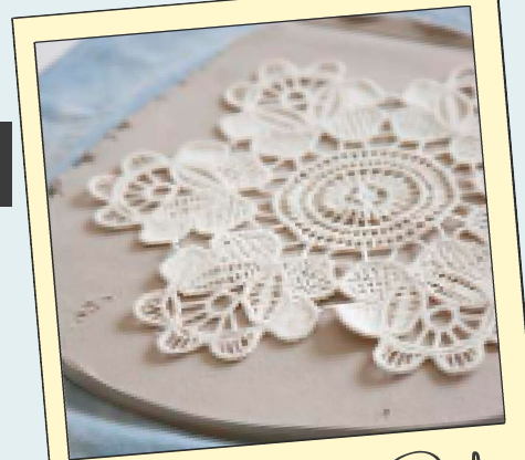
Christmas Candy Dishes