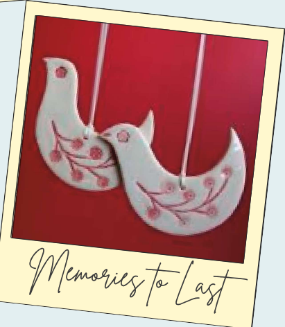
Memories to Last