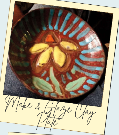
Make & Glaze Clay Plate

All classes are first come first serve, so register quick before spots fill up! 403-823-8300!